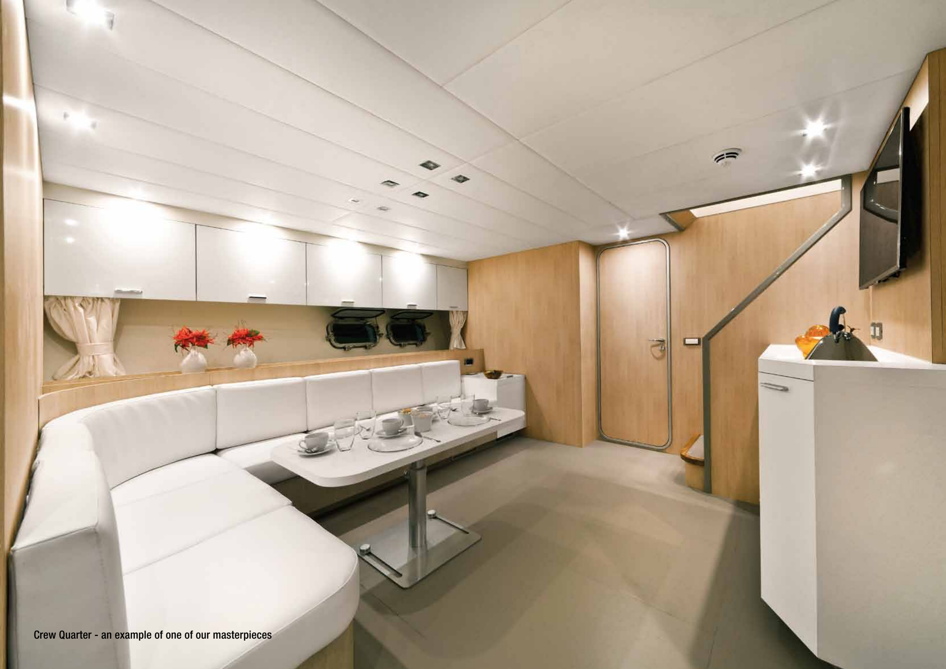
Crew Quarter - an example of one of our masterpieces