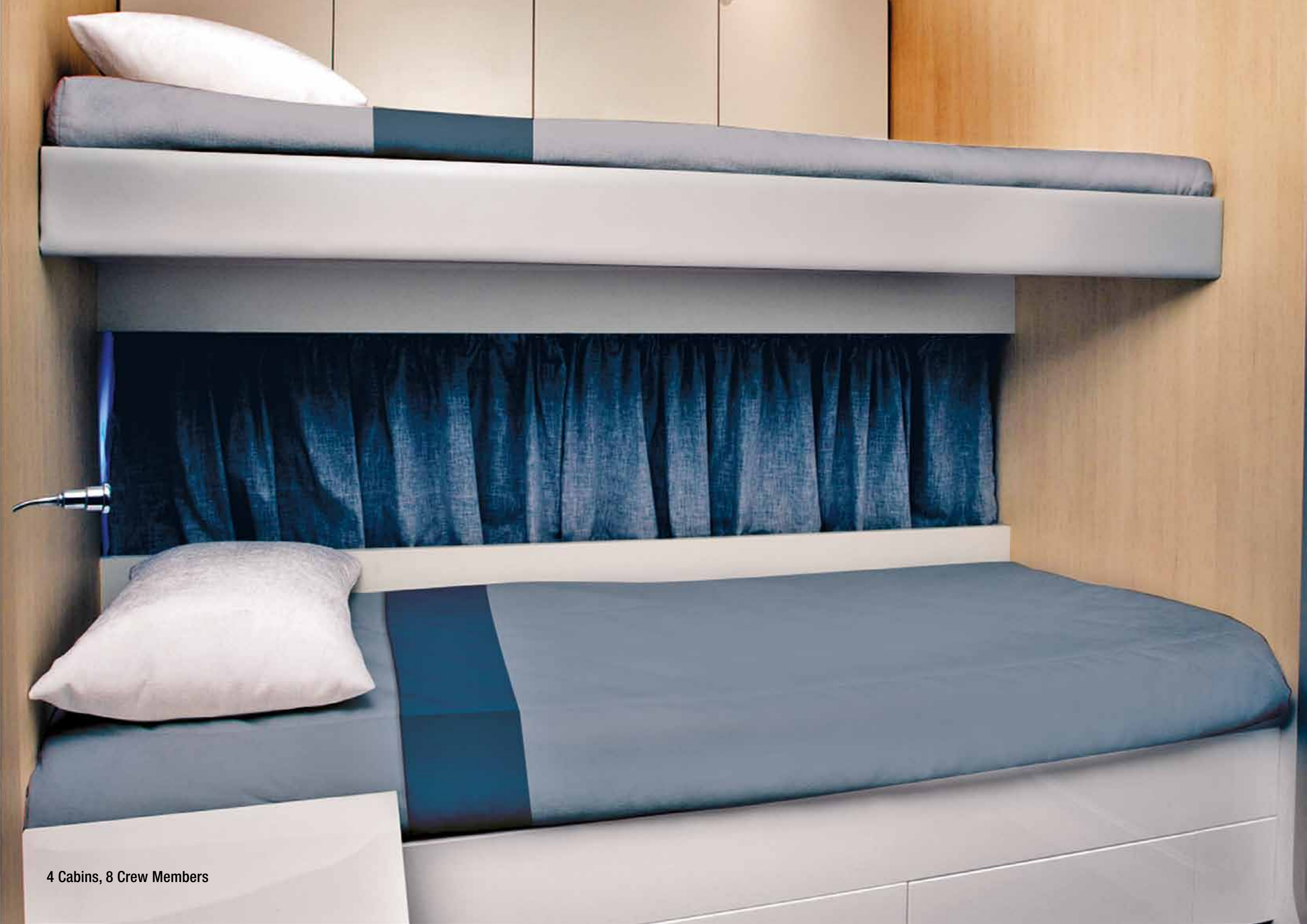
4 Cabins, 8 Crew Members