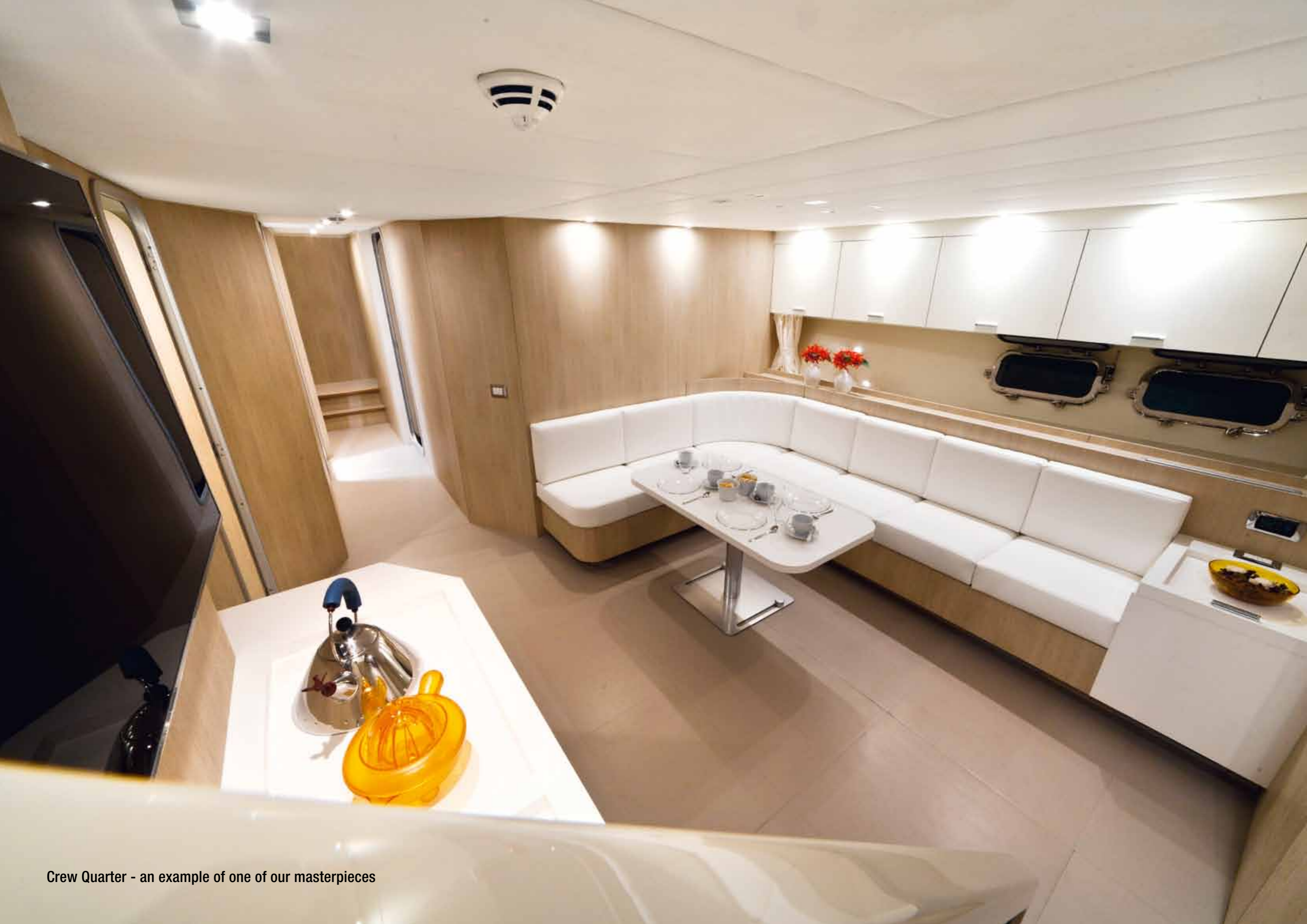
Crew Quarter - an example of one of our masterpieces