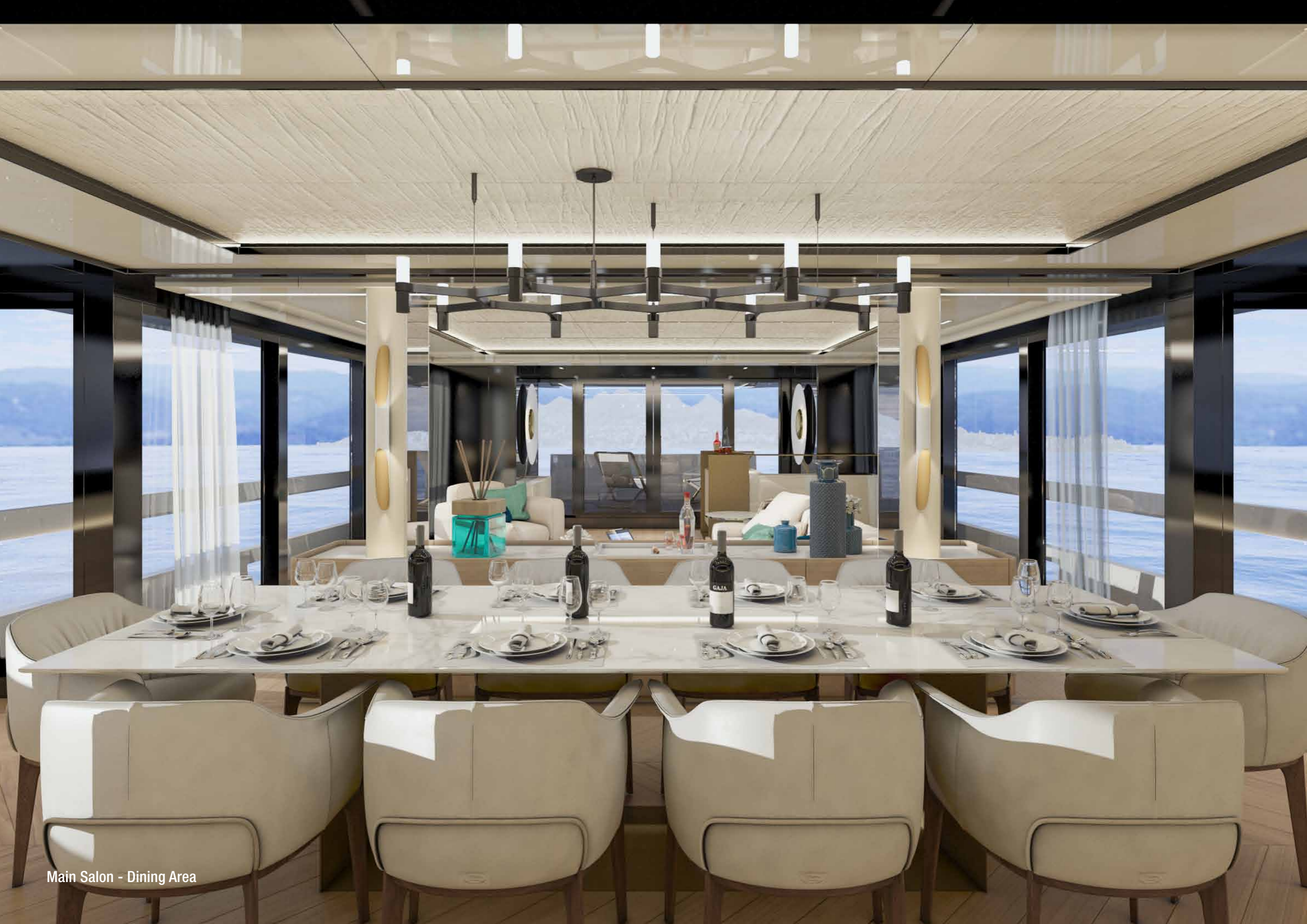
Main Salon - Dining Area