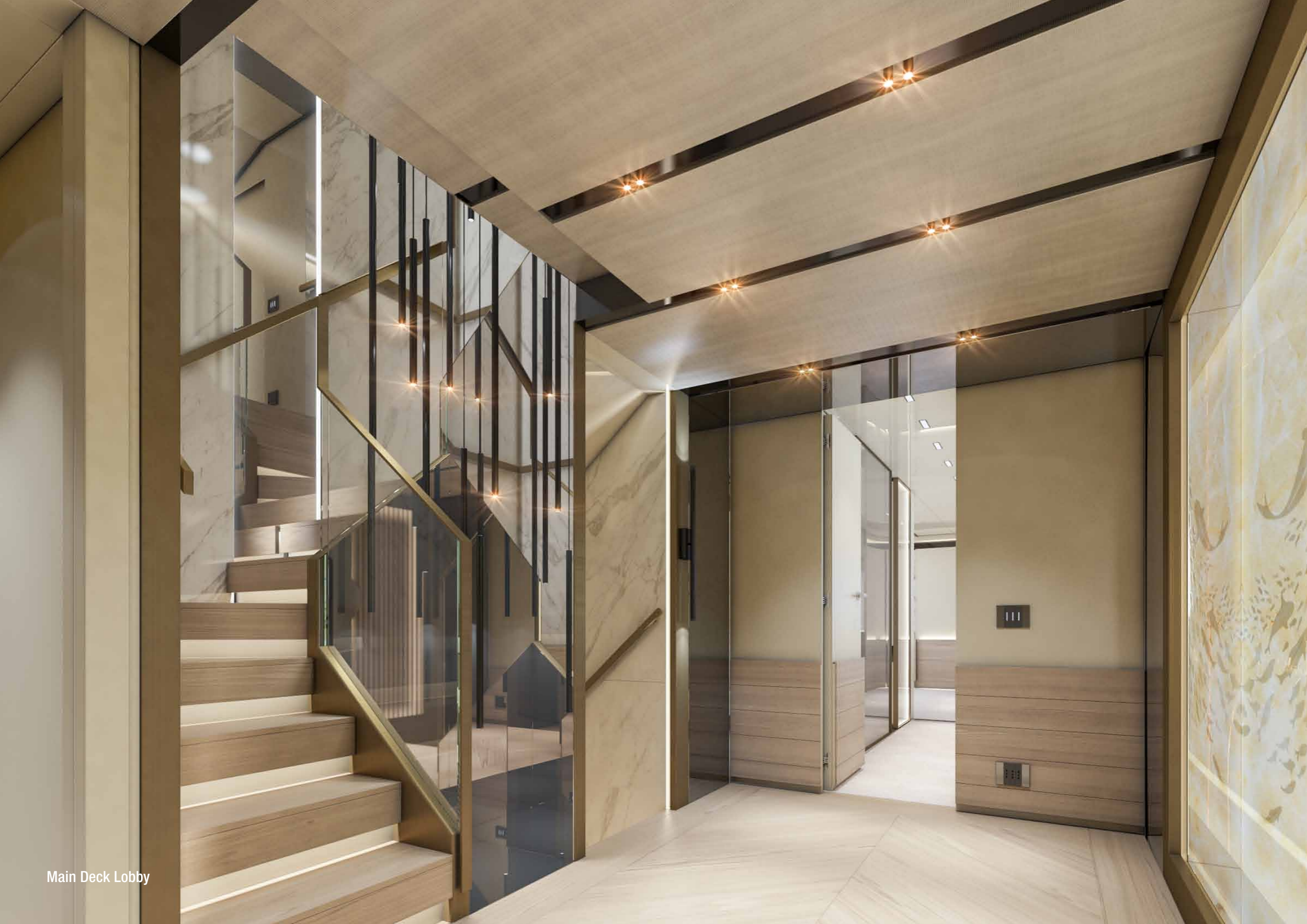
Main Deck Lobby