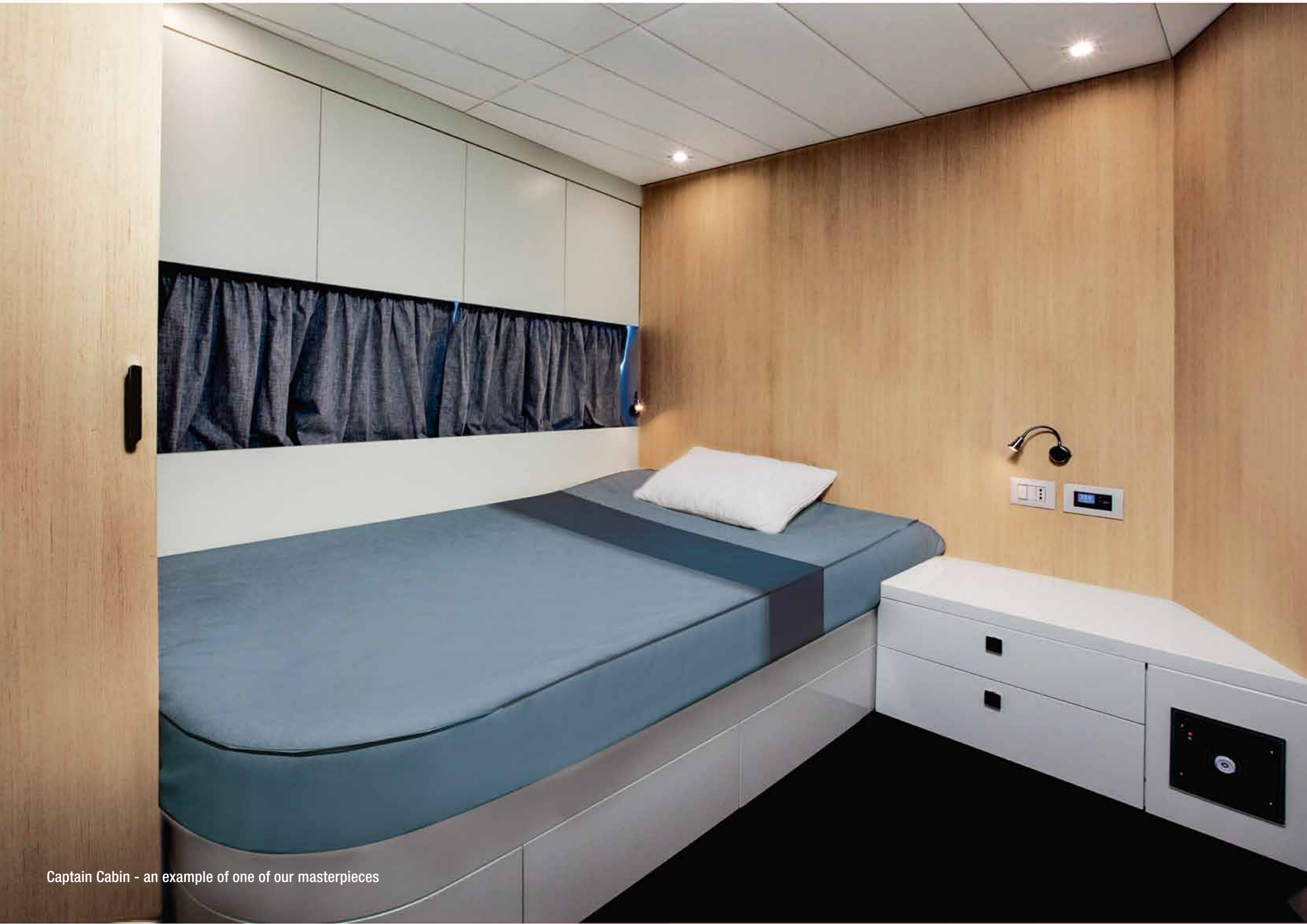
Captain Cabin - an example of one of our masterpieces